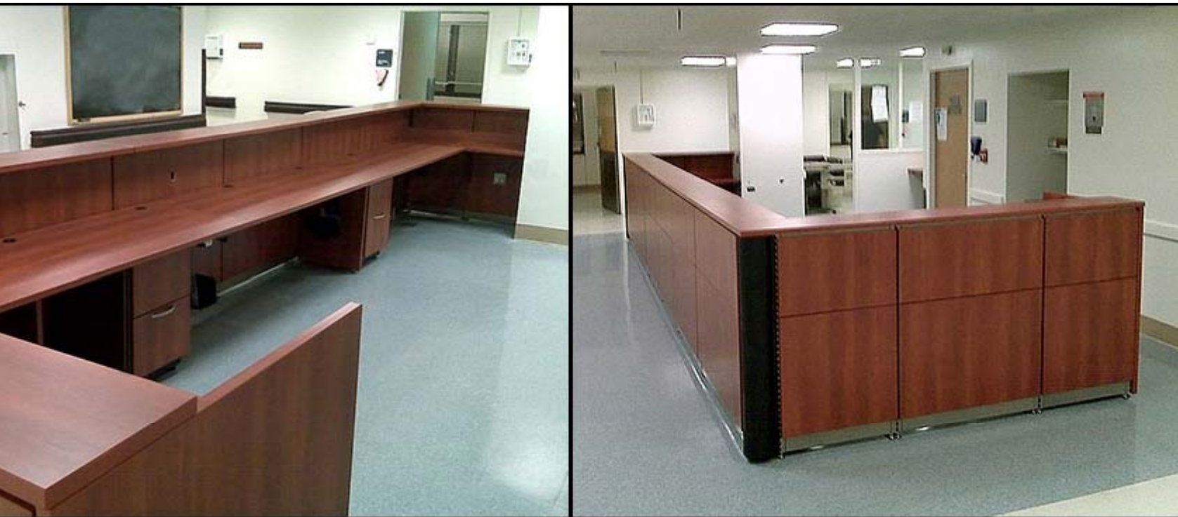
Howard University Hospital – Washington, D.C.