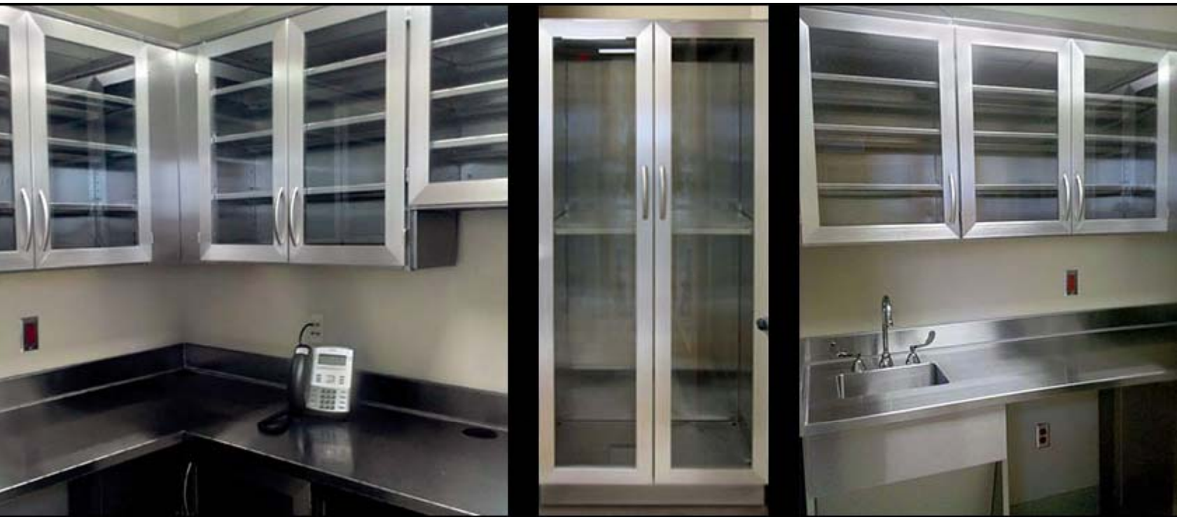
JHS: Wilson Medical Center – Ambulatory Pharmacy Johnson City, New York

Stainless steel casework with aluminum framed doors makes for a striking appearance in this installation. Clear acrylic inserts for overhead cabinets provides content visibility. Stainless steel inserts for base cabinet doors neatly conceals additional supplies. Slope tops minimize dust collection and provides