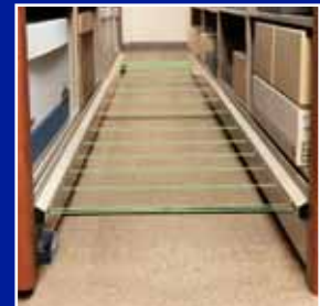
Zero Force Sensor System