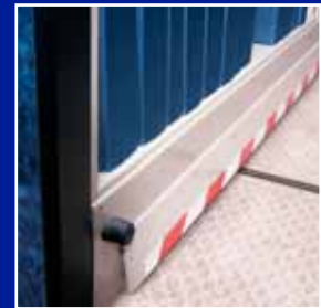
Mechanical Safety Sweep