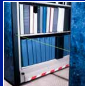
Aisle-Entry Safety Sensor