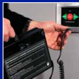
Rechargeable Power Override Unit