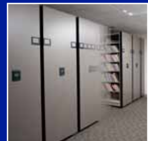
Auto Move Interface