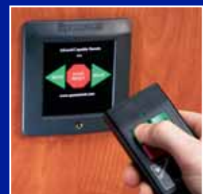
Infrared-Capable Control with Remote User Key