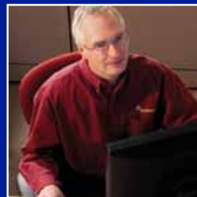
PowerLink Remote 24/7 Monitoring