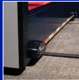
Light-Immune Photo Sweep

Eclipse means configurability. Customize your Eclipse Powered System by adding to its standard features just the options you need and will use right now. Then add more options and functionality as your needs evolve.