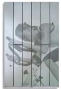
HPL with vectogram