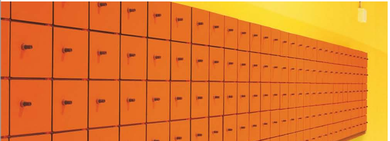
Wall-mounted Cambio Small safe deposit box unit with electronic locking system.