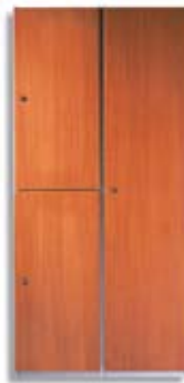
Genuine wood varnish